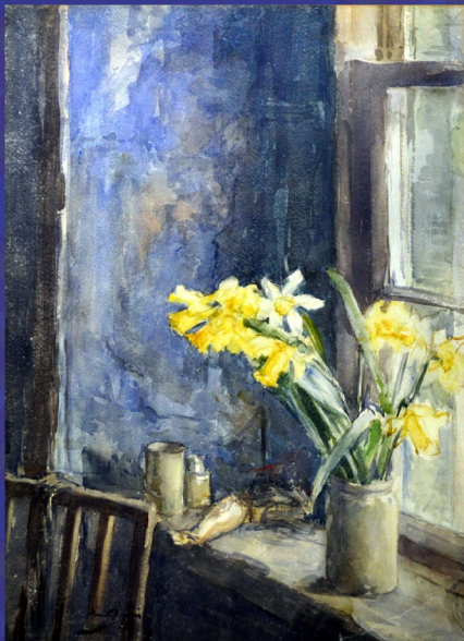
Daffodils by David Foggie, 1918

We also maintain the remainder of the Fine Art Fund set up in 1960 for the benefit of the University's art collections. This stood at £9,538.49 at 1 Aug 2019 and £9,538.49 at 31 Jul 2020.