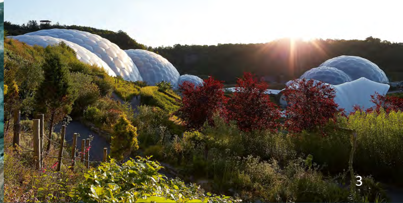
Eden Project Cornwall 2001