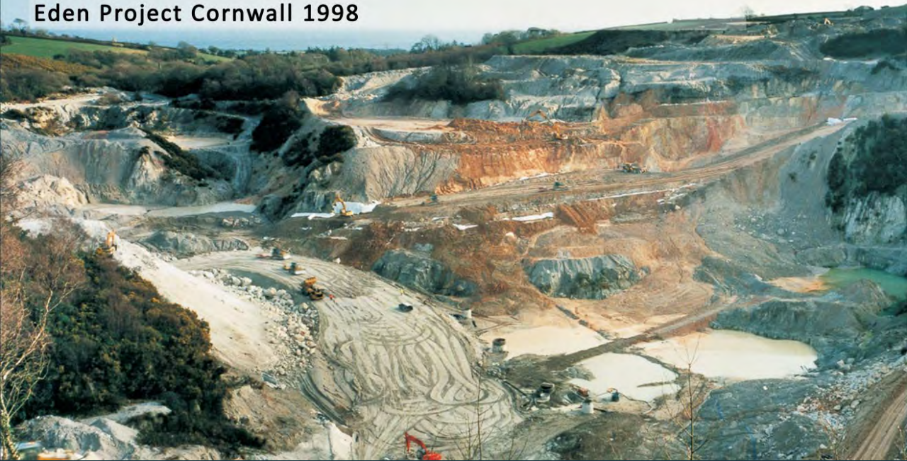
Our first transformation: Eden Project Cornwall 1998

This year Eden turned 20 years old. We took a sterile china clay pit at the end of its useful economic life, and transformed it into one of the most successful regeneration projects the UK has ever seen. From creating 85,000 of soil from recycled china clay waste to building the largest rainforest in captivity, Eden has caught the public imagination. Since 2001 it has attracted over 22million visitors, created over 350 full-time jobs and generated an economic impact of over £2billion for the South-West economy.