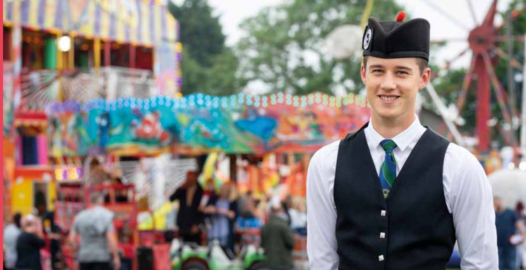
Highland Games, Dunoon