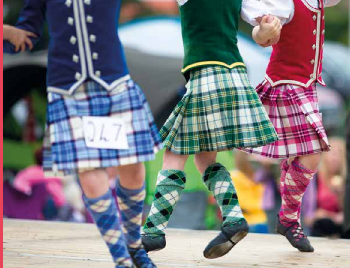
Highland Games, Dunoon

Fantastic culture, beautiful landscapes and famously friendly people... Scotland has passion and innovation at its heart, and these are just some of the reasons why it's an amazing place to live and study.