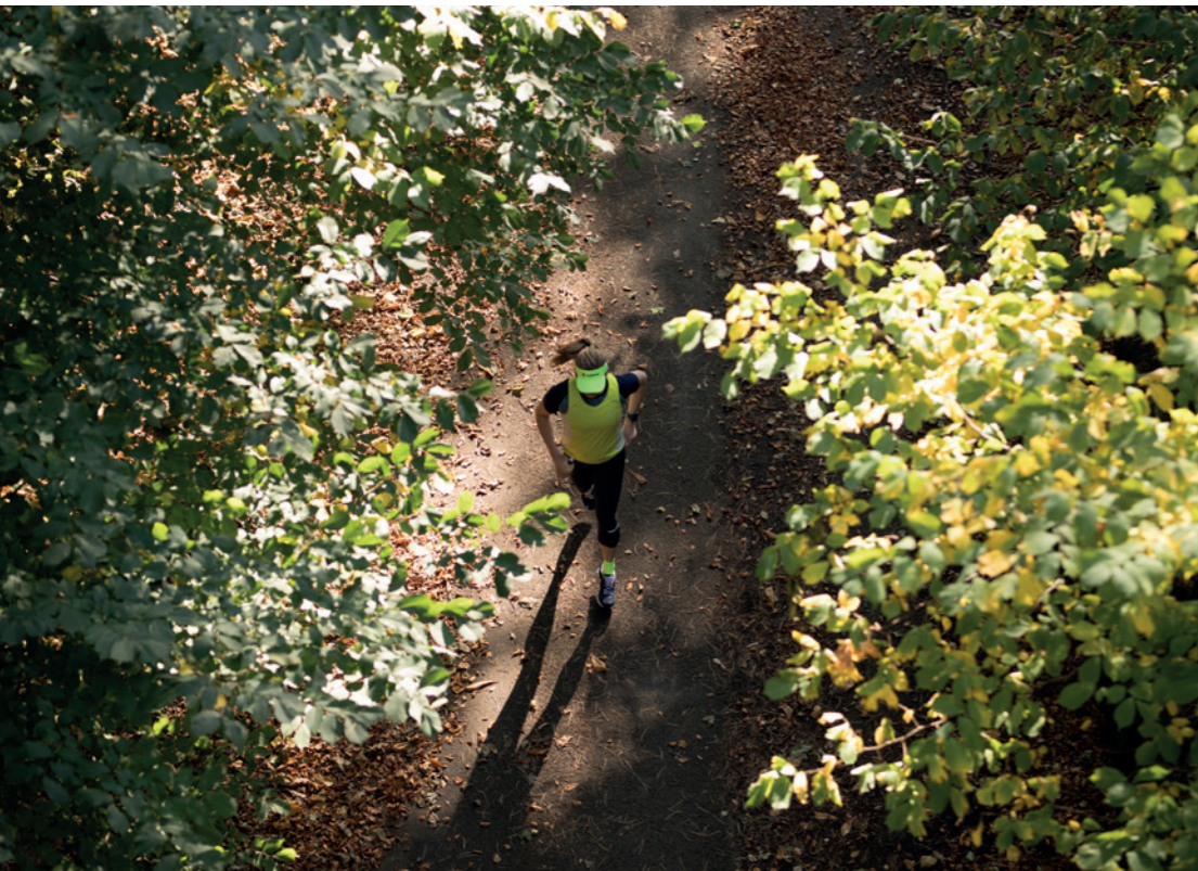
Balgay Park, Dundee