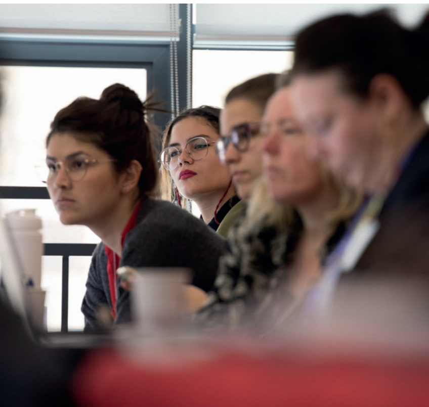
Lecture theatre, City campus