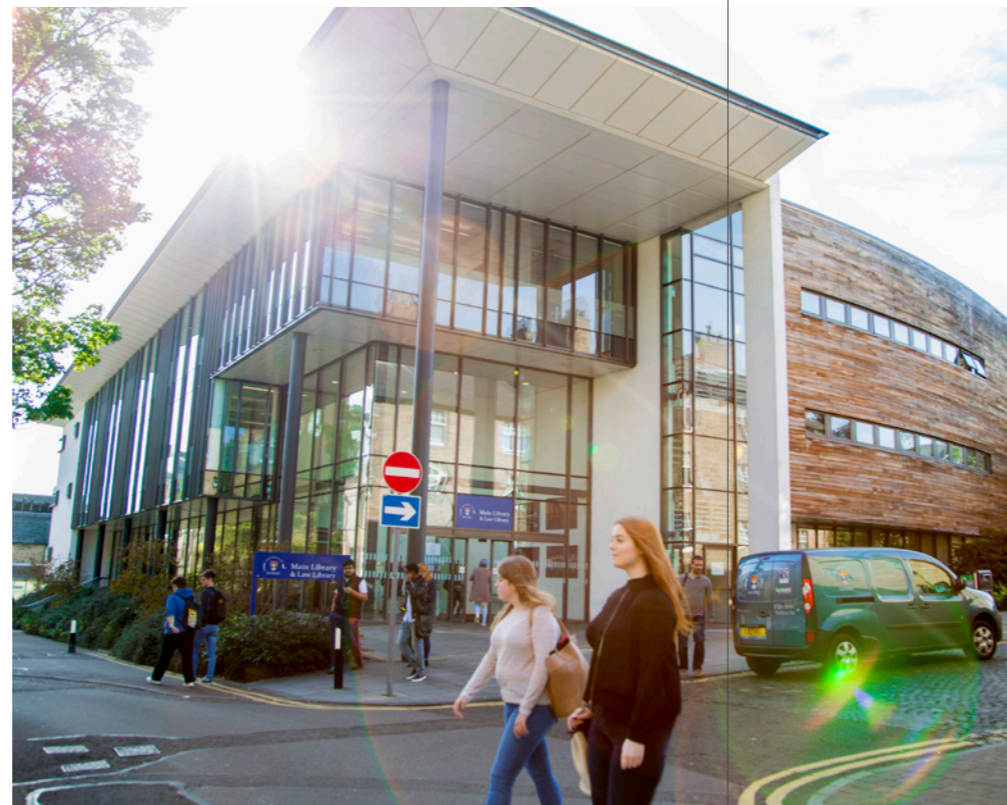
Main Library, City campus

The courses you take at your host university will be finally decided when you meet/liase with your Go Abroad Academic Co-ordinator to prepare your Learning Agreement and have it signed off.