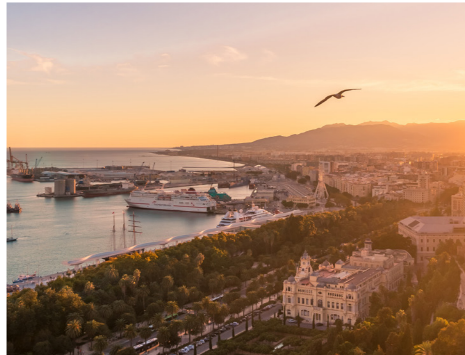
📍 Málaga, Spain