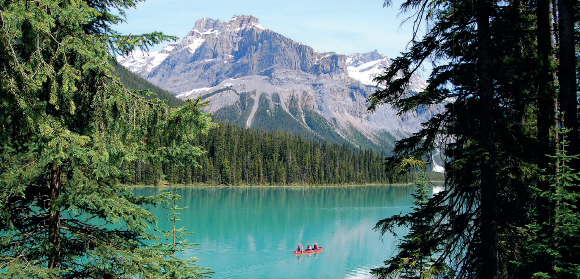
📍 Emerald Lake, Canada