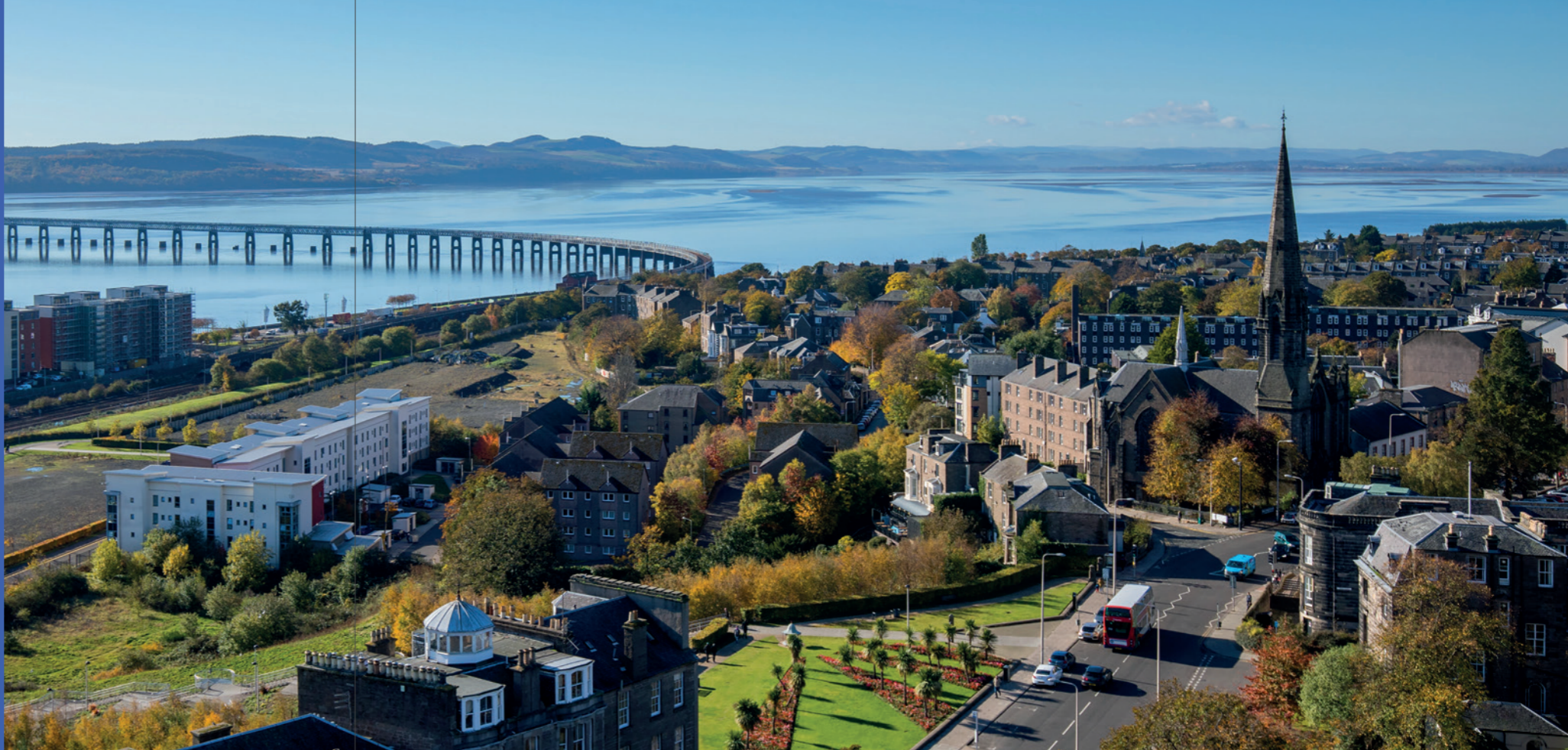
View from Tower Building, City campus

Studying abroad can be a life changing experience, you can combine learning and travel without extending the duration of your degree. You can experience a new culture, improve your language skills, build your confidence and make lifelong friends. But before you go, here are a few things we need you to know.