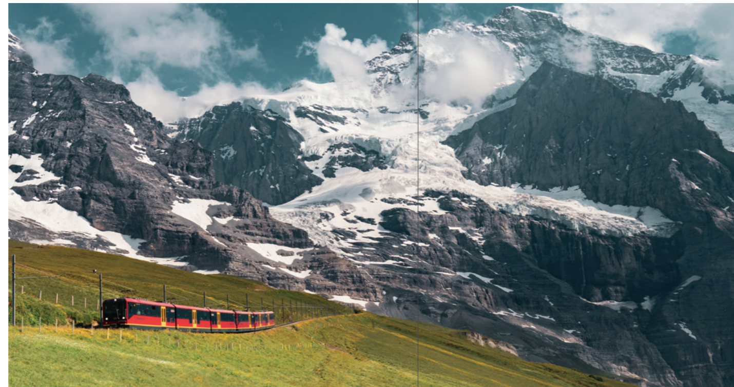
📍 Jungfrau train, Switzerland

If you holiday/travel after your official end date at the host institution and are not returning to your home country immediately then you must arrange private travel insurance cover for this period.