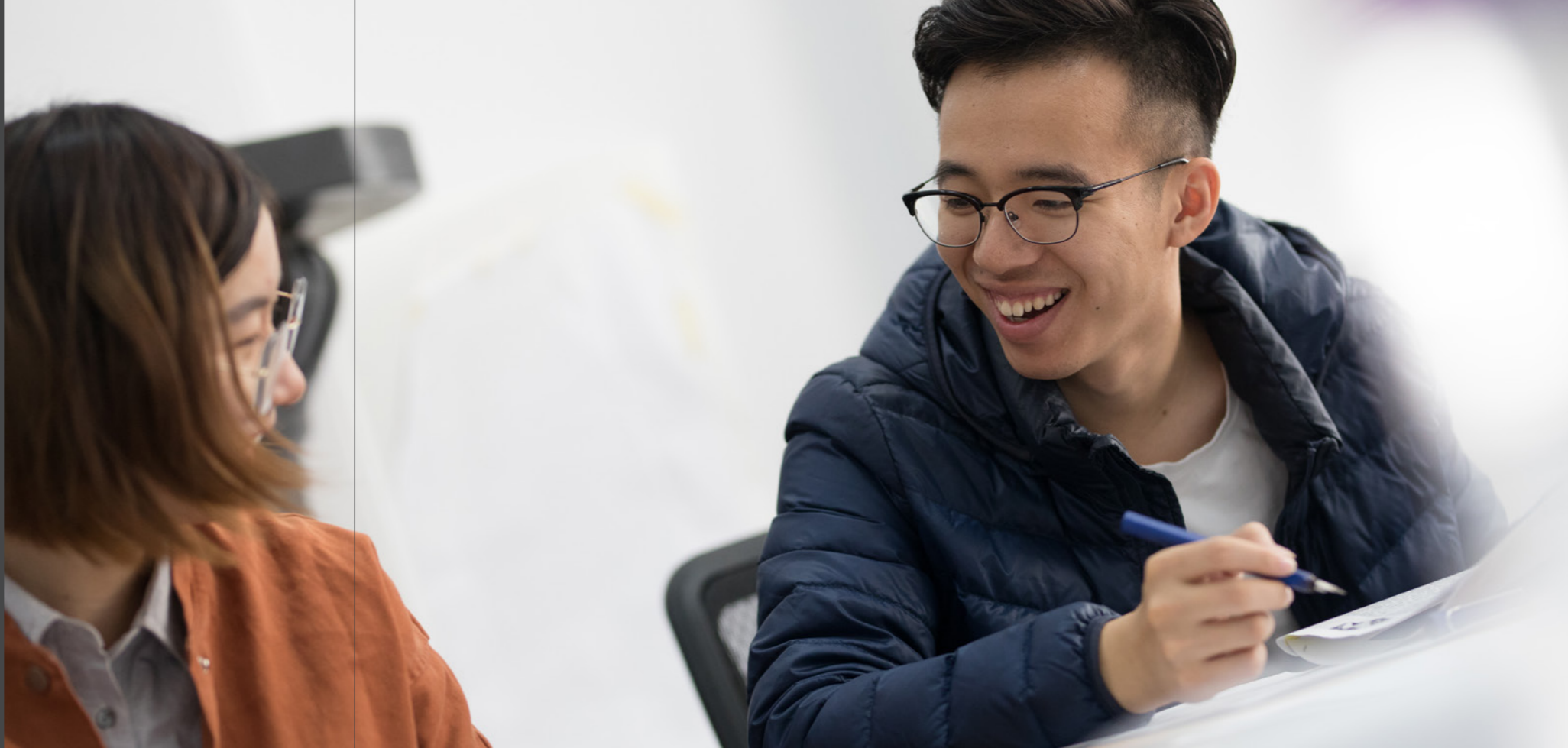
International College, University of Dundee

You must have passed all of your end of year exams meeting any conditions applied by your School/discipline when you were given your provisional offer to Go Abroad.