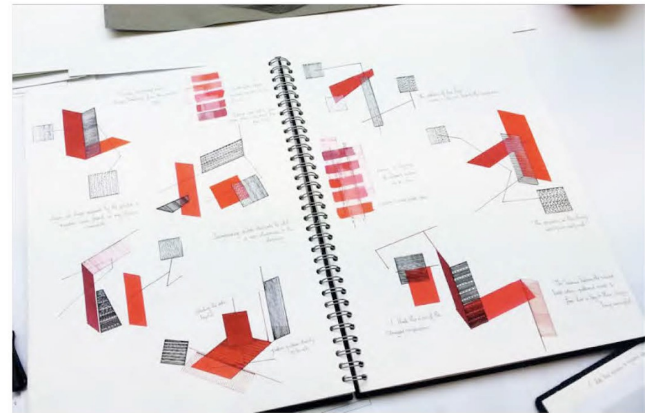
Sketchbook showing concept development and use of mixed-media, collage to record my investigation