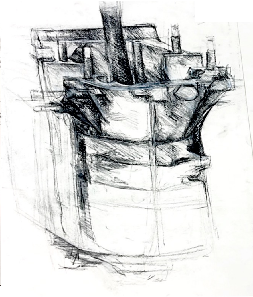
line and tone drawing studies