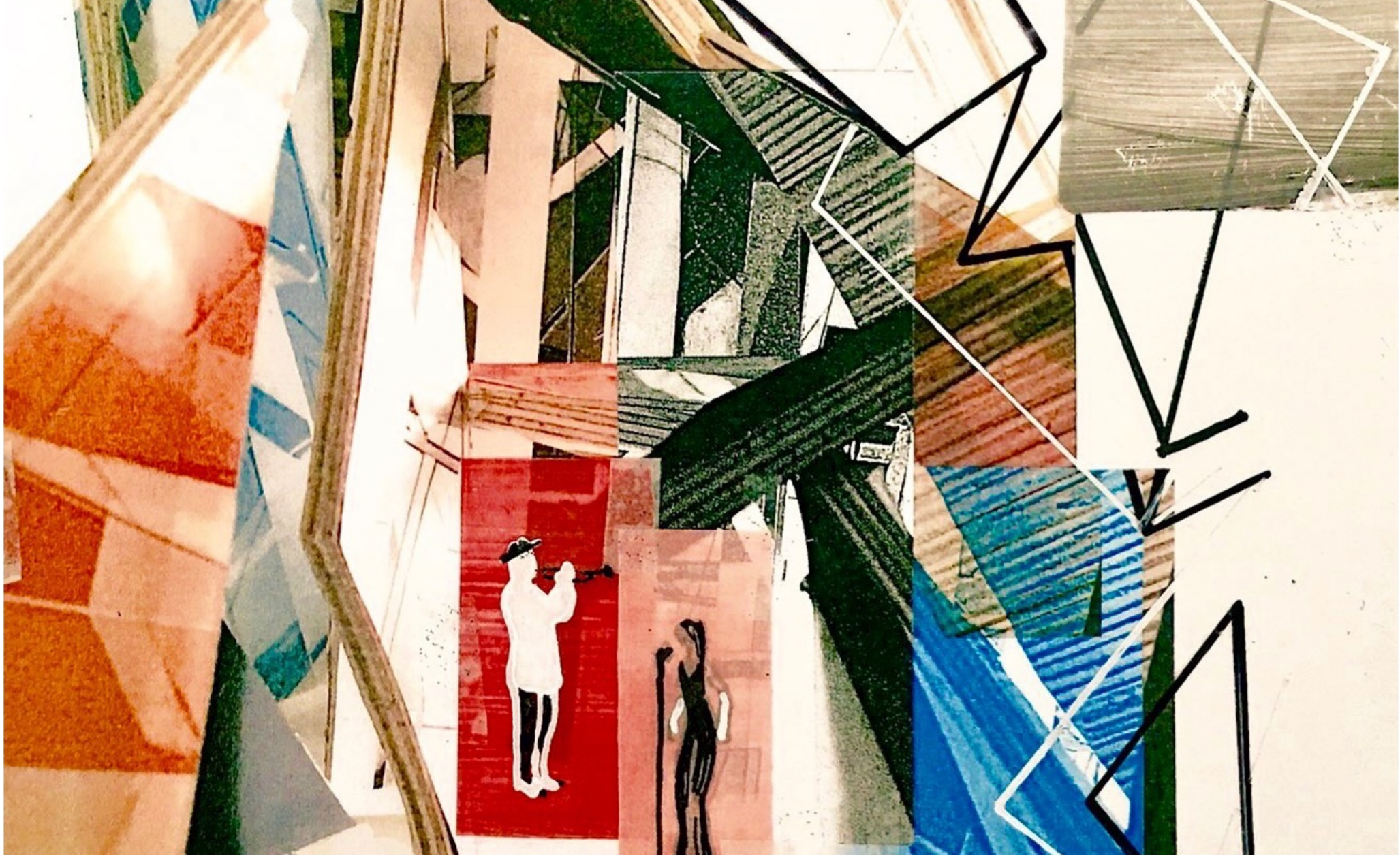
exploring spatial ideas through expressive and experimental structures