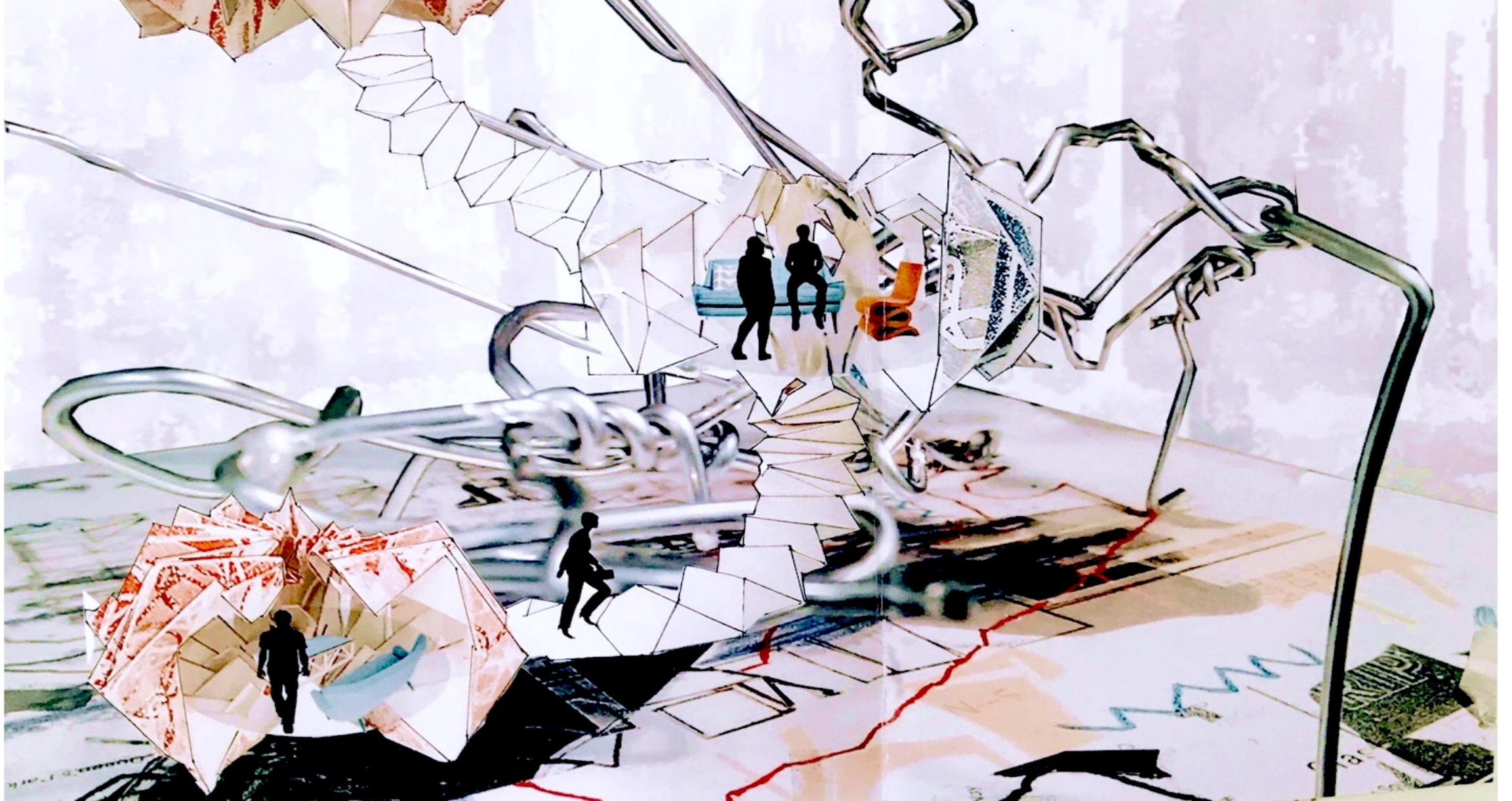
using folding, origami, metal to explore a fictional space