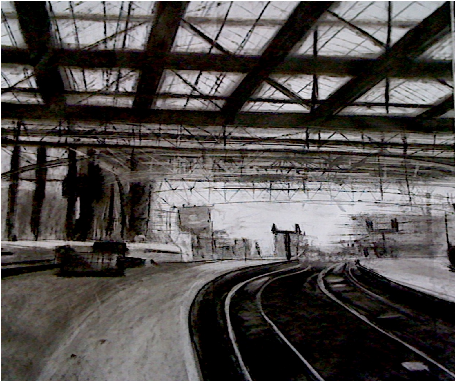
charcoal study of a train station